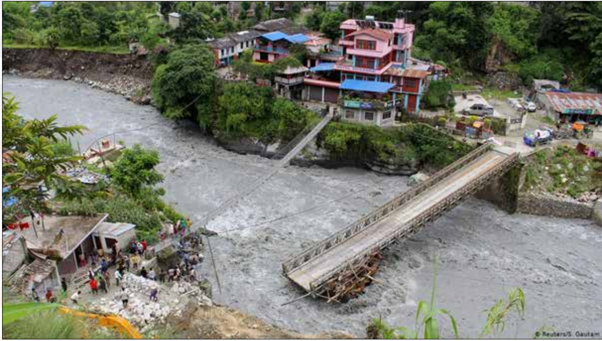
Photograph 2: Huge physical and human properties losses by landslides in Lidi, Sindhupalchok, Bagmati Pradesh

It is indicative that from the figures 1 and 2 landslide incidents is most destructive disaster for Nepal. Almost all hilly and mountain areas of the country affected by landslide however, the nature, intensity and trends are varied from east to west and north to south. Landslides of this year monsoon killed more than 60 people and damaged huge amount of physical properties in a single location i.e. Lidi of Sindhupalchok district and Badimalika in Bajura district. Therefore, hazards incidents losses and damaged recorded in different scales in different geographical regions and provinces. Landslide observed as the main disaster in hilly and mountainous regions whereas floods/inundation and fire found more in low land area i.e. tarai plain. Similarly, lightning/thunderstorm found to increasing incident in all parts of the country. The province wise disaster incidents found varied such as landslide is much more in No.5, Gandaki Pradesh, Sudur Paschim Pradesh and No 1 Pradesh. Whereas the incidents of flood and lightning observed more in No.2 Pradesh, Bagmati Pradesh and Sudur Paschim Pradesh. The major disaster incidents frequencies are presented in table 1.