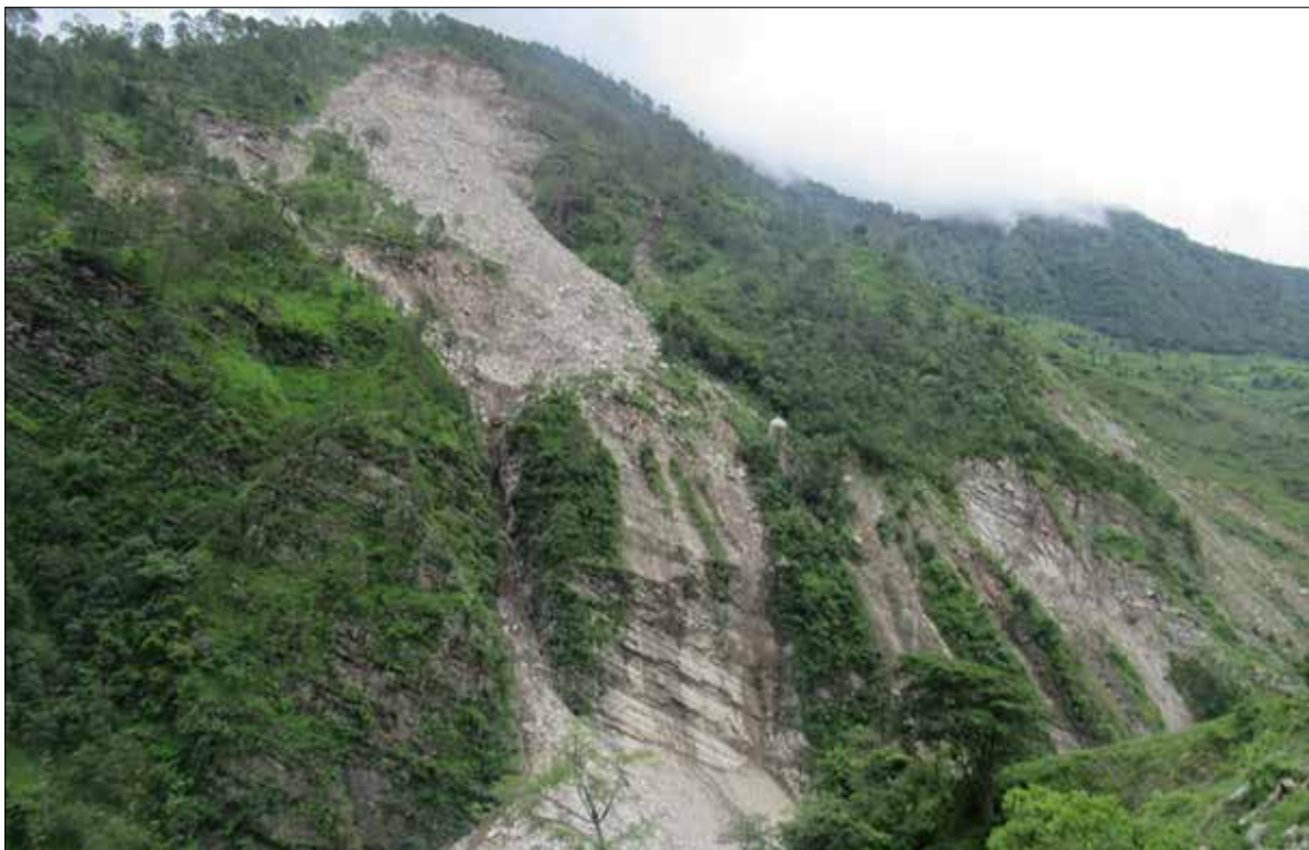
Photograph 1: Landslide Badimalika, Bajura of Sudur Paschim Province where 60 households were displaced after a landslide in July, 2020.