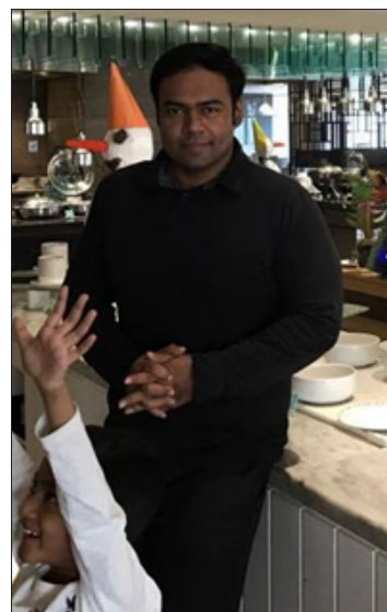
Figure 2: The Author

Author (Figure 2) completed B. Pharm (2004) and M. Pharm (2006) from Department of Pharmaceutical Technology, Faculty of Pharmacy, University of Dhaka. He has completed his MBA (2007) from East West University. He was in faculty of Pharmacy, World University of Bangladesh as an Assistant Professor. Along with 8 years of teaching experience, he also worked for reputed pharmaceutical companies in strategic management for 5 years. He authored 11 books (Table 3) and many articles on alternative medicines, patient care, marine drug sources and other recent issues of healthcare in several journals (Table 4) and newspapers (Table 5). He is now acting secretary and treasurer in Dr. M. Nasirullah Memorial Trust.