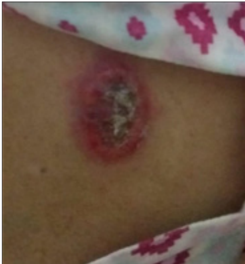
Figure 1: Basal cell carcinoma presenting as an ulcer at the left upper outer quadrant of breast

BCC is a local spreading disease, although metastasis is rare but complete physical examination is important to rule out regional and distant metastasis, especially in long standing, advanced with aggressive histologic features and recurring tumors.