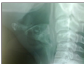
Case 2 : Figure 6