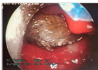
Case 2 : Figure 7