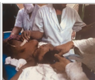
Case 1 : Figure 2