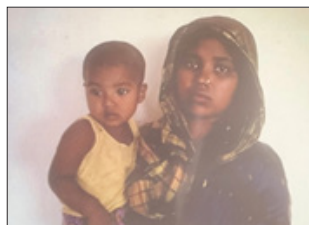
Case 1 : Figure 4