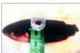
Case 1 : Figure 3