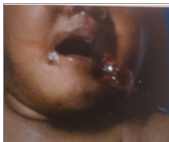
Case 1 : Figure 1