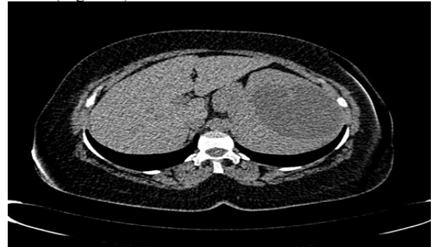
Figure 2: Hypo dense, septate image with irregular contours, with low interior densities.

size and configuration. Spleen showing a hypo dense, septate image, with irregular contours, with low densities in its interior, said lesion slightly compresses and displaces the left kidney, downwards and backwards. The lesion did not capture contrast. (Figure 2)