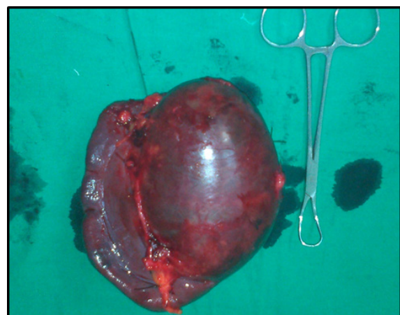
Figure 3: Spleen weighing 500gms. In addition, it measures 15x12x5 cm, presenting a smooth, shiny capsular surface of a purplish-brown color, which bulges and makes relief, in the region of the pedicle.

The macroscopic study showed: Surgical specimen from total splenectomy, weighing 500gms. In addition, it measures 15x12x5 cm. presenting a smooth, shiny capsular surface, of a purplish brown color, that bulges and makes relief, in the pedicle region: of relentless consistency, corresponding to the cut, with a cystic, multinodular area, entirely occupied by abundant blood, and measuring 10x7cms. Rest of the splenic parenchyma of friable consistency, reddish in color, with a whitish stippling. Figure 3.