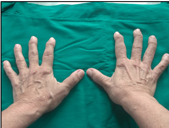
Figure 1: Deformity of the third phalanx on all fingers of both hands