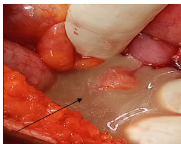
Figure 2: Shows intraoperative findings of abscess from ruptured appendicitis