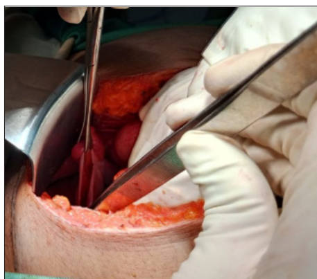
Figure 1: Shows intraoperative finding of right ruptured ovarian cyst

The pelvic cavity blood sucked out, the abscess drained and purse string suture applied on the cecum circumferentially burying eaten up appendicular base. The rupture simple right ovarian cyst cystectomy done. Abdomen lavaged with Warm Normal saline. Drain left at right lower quadrant abscess cavity. The abdomen was closed in layers. The patient was extubated on the table and transferred to the postanesthesia care unit with stable vital signs.