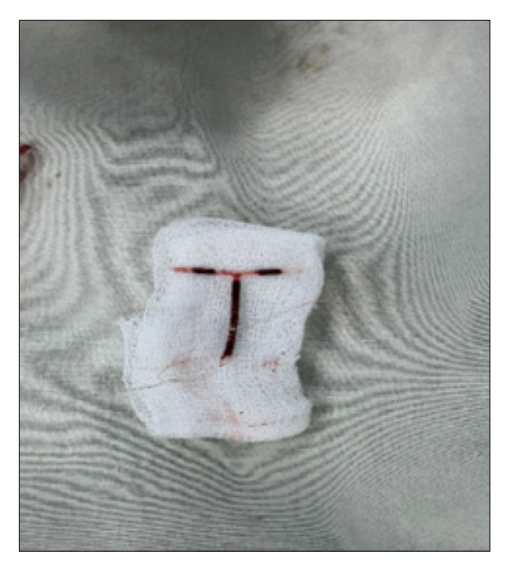
Figute 6: Rusted Copper T seen after its removal