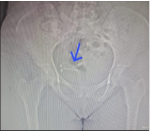
Figute 2: CT Scan showing misplaced IUCD in the pelvis