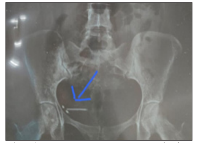
Figute 1: XRAY ABDOMEN ANDPELVIS showing IUCD lodged on the pelvic wall

were visible while Copper T itself was in the urinary bladder musculature. There was abscess of around 4cm*3cm*3 cm along the horizontal arm of the embedded copper T in the bladder musculature. As the copper T was not in the cavity of urinary bladder it could not be retrieved by cystoscopy. Gently with meticulous dissection, the horizontal arm of the copper T was dissected from the bladder musculature and abcess of around 15 cc was drained. After removal of the Copper T, it was seen that the copper T arms were rusted. Suturing of the bladder wall was done using Polyglactin 2-0 in a double-layer fashion. After the suturing was complete, Methylene blue dye was pushed retrogradely to check for any leaks in the dome of the bladder, but no methylene blue was found in the cavity. Suture line was intact with no leakage of the dye. After taking the correct count of the mops and instruments, abdomen was closed in layers. Post operative period was uneventful. Patient was covered with injectable antibiotics post operatively. Foleys catheter was kept for 12 days after which the foleys was removed and patient passed urine post removal of foleys. Patient was vitally stable and symptomatically better and thus got discharged.