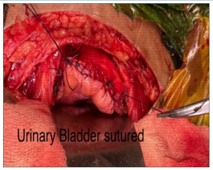
Figute 5: Postoperative picture after urinary bladder wall suturing and retrograde pushing of methylene blue showing no leakage of the dye in the pelvic cavity.